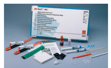
Introductory Kit: 3415